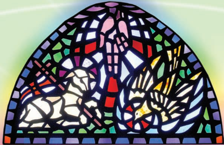
The Holy Trinity, stained glass